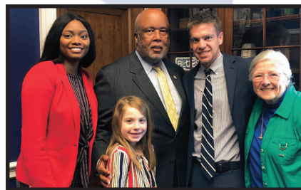
To see more images from the GAC, please visit our Facebook page!