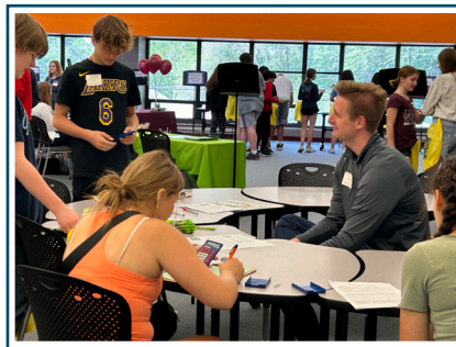
Fort Atkinson Middle School