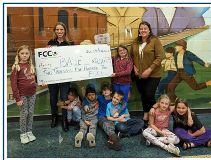
Purdy Elementary School FCCU donates $2,500 to Badgerland After School Enrichment (BASE)