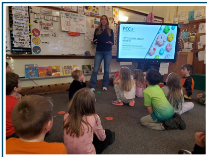
Luther Elementary School

880 financial literacy workbooks provided to local schools