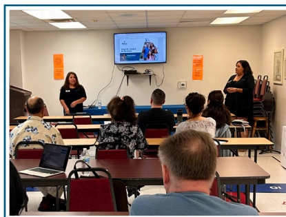
📍 Watertown Senior Citizens Center