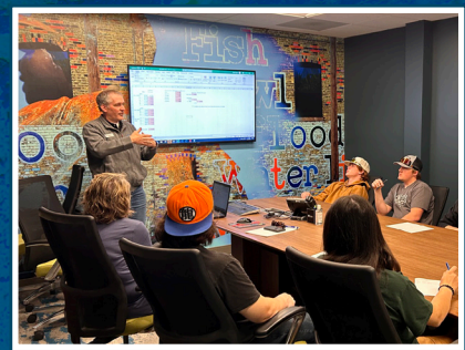
FCCU Main Branch