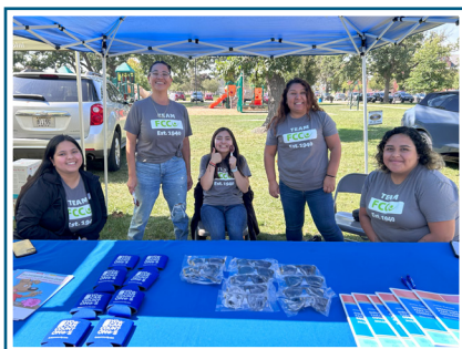
📍 Jones Park, Fort Atkinson

$11,480 Inclusion Fund Grant received by Wisconsin Credit Union Foundation